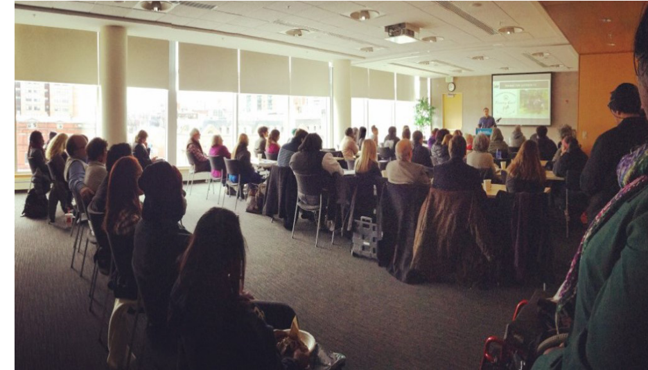
Students and guests listen attentively to presentations during the Experiential Learning Showcase.